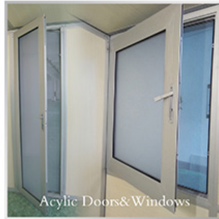
Acrylic Doors& Windows