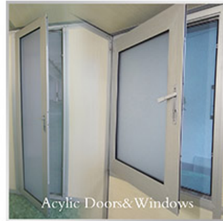
Acrylic Doors& Windows