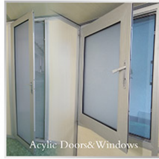
Acrylic Doors& Windows